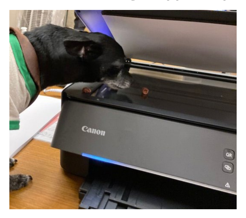
Don't be like Daisy. Don't keep printing treats.